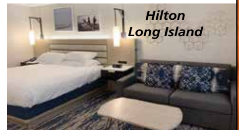
Hilton Long Island

FOR INQUIRIES OR TO BOOK YOUR NEXT GROUP OR EVENT AT ANY OF OUR HOTELS ACROSS THE COUNTRY PLEASE EMAIL US AT