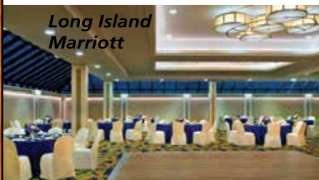
Long Island Marriott