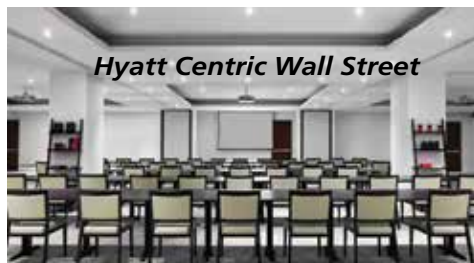
Hyatt Centric Wall Street